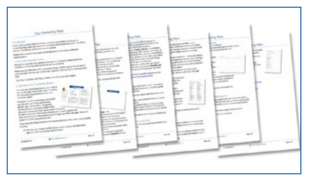
Marketing plan template